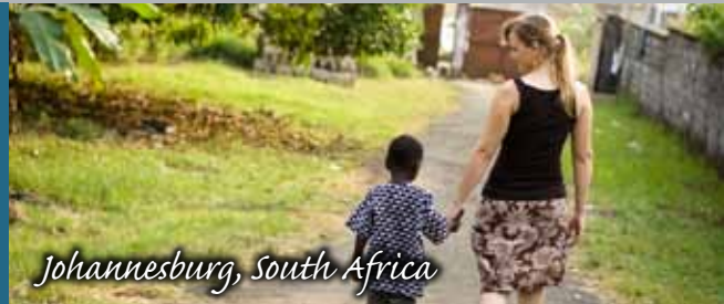
Johannesburg, South Africa

With medical coverage from 5 days to 12 months, Day Tripper Group Travel from HCC Medical Insurance Services (HCCMIS) is with you almost anywhere on the planet you may travel with a group of 5 or more for mission trips, large family vacations, student groups abroad, corporate groups, and overseas excursions for other large organizations.