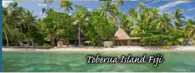
Toberua Island Fiji